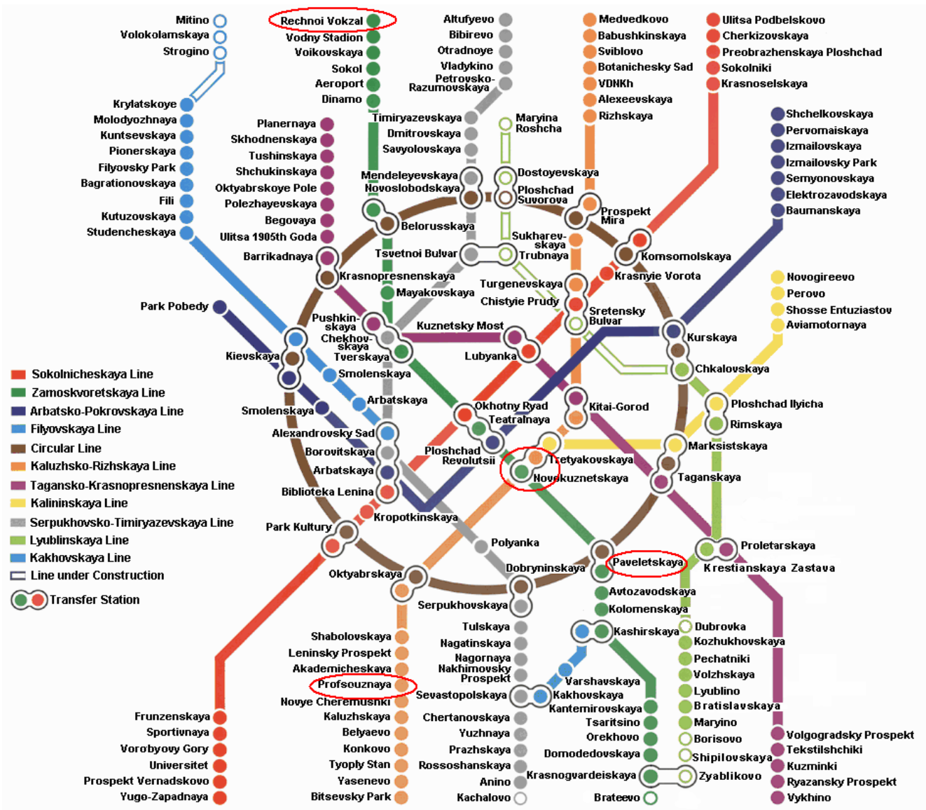
Map of Moscow metro